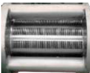
scanDebone mounted with slit filters.