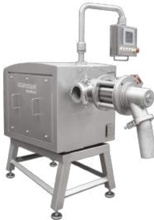
Superpump SP 250 shown below feeding a scanDebone 150.

The scansteel foodtech® scanDebone series produces an adjustable, very high yield and at the same time it produces a final product with low calcium content in the final poultry and fish raw materials, which supports a high product quality.