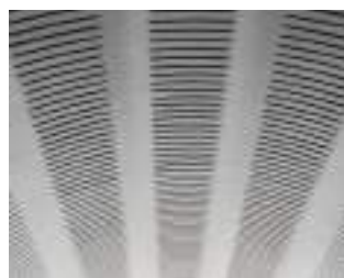
Slit filter seen from inside.