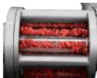
Final product: deboned poultry. View 1 (one).