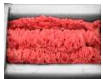
Final product: deboned poultry. View 2 (two).