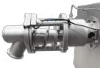
scanDebone 150 shown without slit filter.