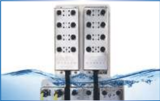
8-PORT STAINLESS STEEL BLOCK