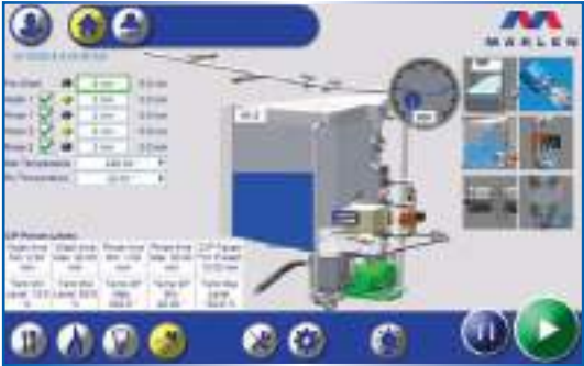
ICON-BASED HIGHLY INTUITIVE HMI