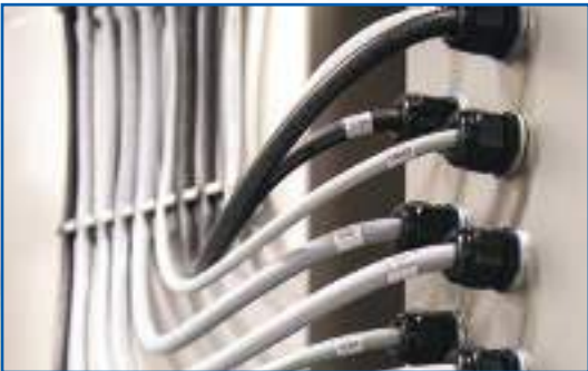
HYGIENIC CABLE MANAGEMENT